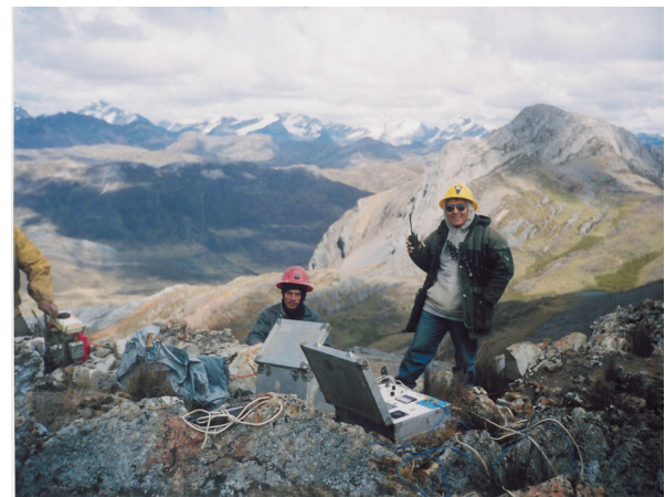
IP Survey for mineral exploration