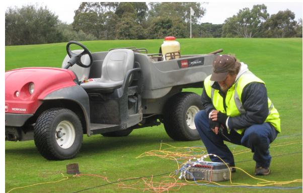
Resistivity Survey for groundwater investigations

Fugro Ground Geophysics (FGG) have been at the forefront of the development of high resolution 3D Multipole-Dipole IP. FGG has developed Safe Operating Procedures, SOP's, which have been accredited by the Energy Safety Directorate of the WA Dept of Consumer and Employment Protection, DOCEP. This compulsory accreditation is now required, by law, by all providers of high-powered electrical surveys in West Australia, to ensure approved systems and procedures are in place to produce high standards of electrical safety for both the crew and general public.