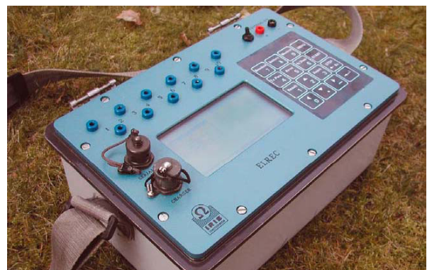
Industry Standard and custom in-house hardware and software